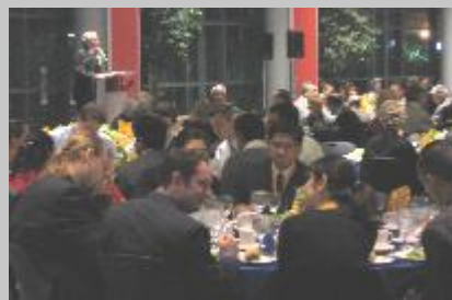
Honors College Anniversary Dinner