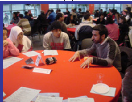
Passing the Torch of Knowledge