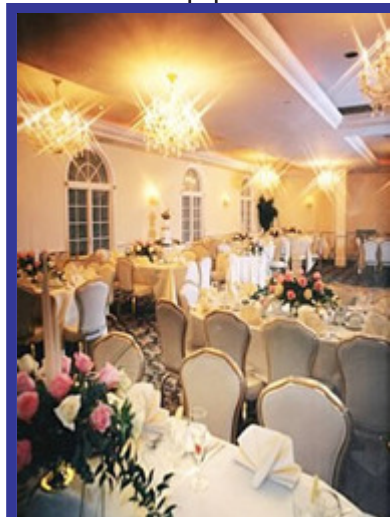
Paris Inn Banquet Hall

store for students. It is truly a must-attend event, as it will be the greatest occasion of the year.