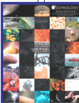
Cover of the latest Technology Observer

Christian are graduating this May. It is their wish that the reputation they have built is not only kept alive, but also enhanced to a higher level. Those interested in becoming a part of the editing, graphic design, or writing team should contact csh2@njit.edu or lmj2@njit.edu . Meanwhile, stay on the lookout for the next issue scheduled to come out the end of March and be sure to visit their website at http://honors.njit.edu/about/tech_observer.php .