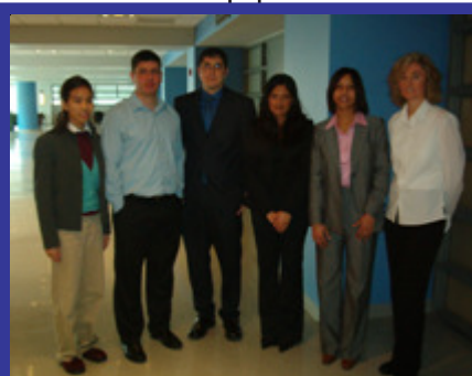
Dress for Success