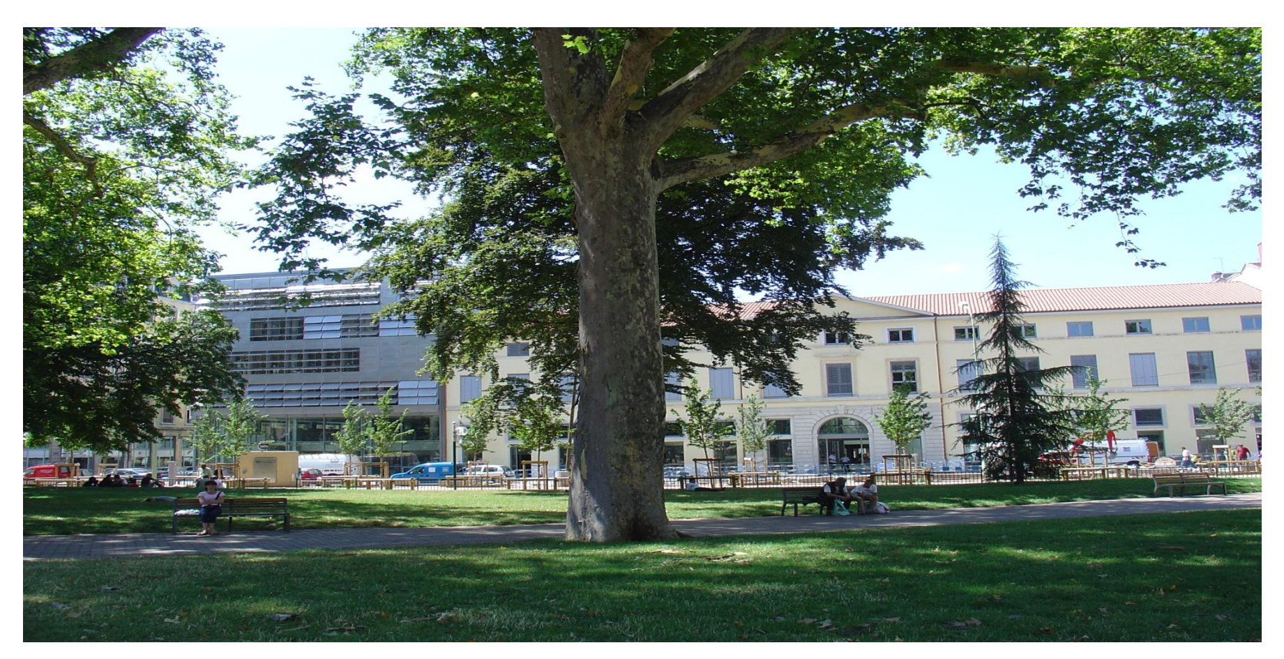
Place Carnot, opposite Perrache train station